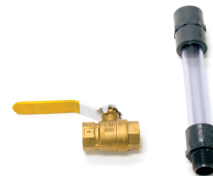
Manual & Visual Purge Options