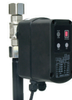
AutoPurge with motorized ball valve

"Certified <0.25 weighted average percent lead" and "Complies with California Health and Safety Code Section 116875 (commonly known as AB19530)."