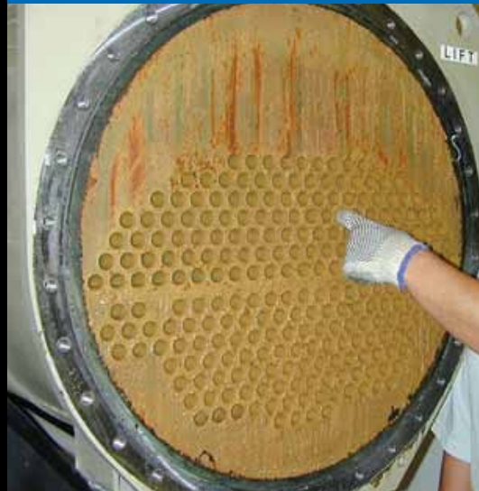
Prevent Buildup in Chillers

The effects of this damage include fouling and plugging, pitting, increased Kw usage, valve failure, and increased maintenance costs.